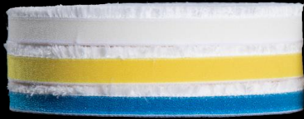
9.MF160 - Ø 160mm (6")