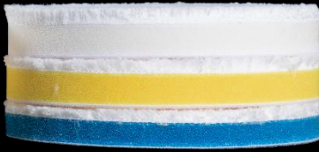
9.MF130 - Ø 130mm (5")