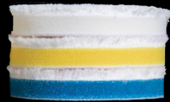
9.MF80 - Ø 85mm (3")

Three sizes available to support full size tools like the LHR15, LHR21, LK900E and small tools like the LHR75. Each pad is specifically sized slightly larger than the compatible backing plate to provide edge protection during use. High-performance fabrics. The face material for each pad was developed to deliver the highest quality results possible for its given performance range including tweaks to fiber length, density, and denier.