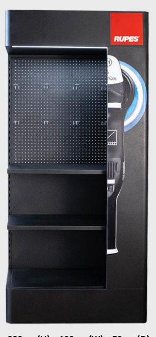
220cm (H) x 100cm (W) x 50cm (D) 86 kg (hooks & shelves included)