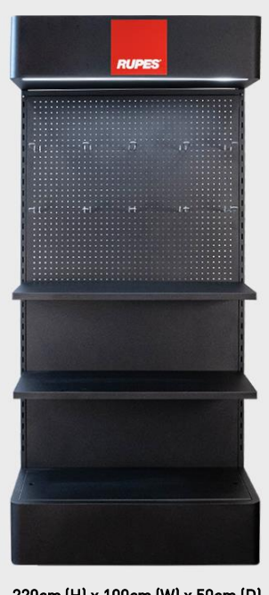
220cm (H) x 100cm (W) x 50cm (D) 73 kg (hooks & shelves included)