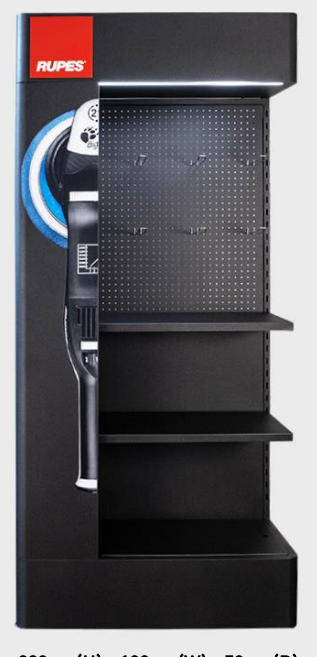
220cm (H) x 100cm (W) x 50cm (D) 86 kg (hooks & shelves included)