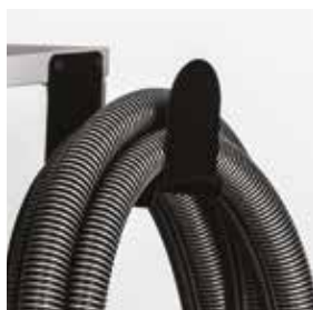
2 Supports for hose asseblies