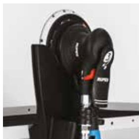
2 Tools holders