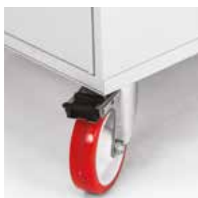
2 Big swivel rubber front wheels with brakes