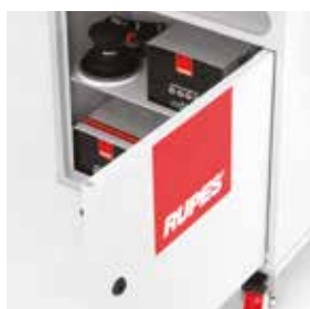
Storage cabinet with closed door