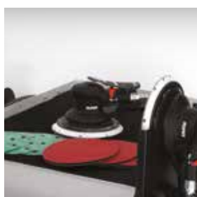
Work rubber table with big multipurpose container